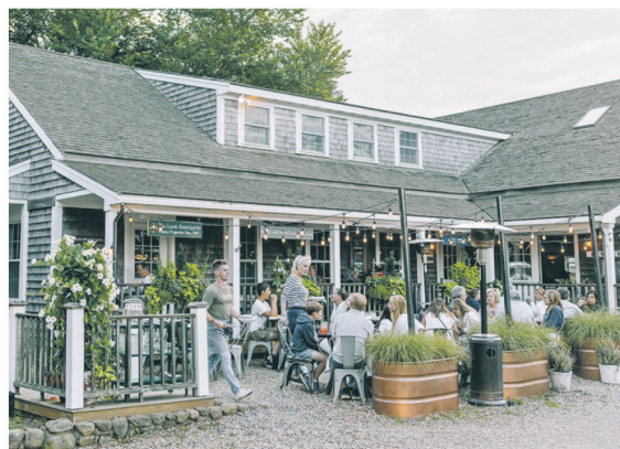
The Chilmark Tavern is a popular upscale dining spot even though the town is dry.

Housed in a building from 1900, this one-stop shop sells household basics and local produce, with a special emphasis on meats, cheeses, and charcuterie—not to mention freshly baked baguettes. It also has a takeout counter (try the pizza). People like to meet on the porch for eats and conversation.