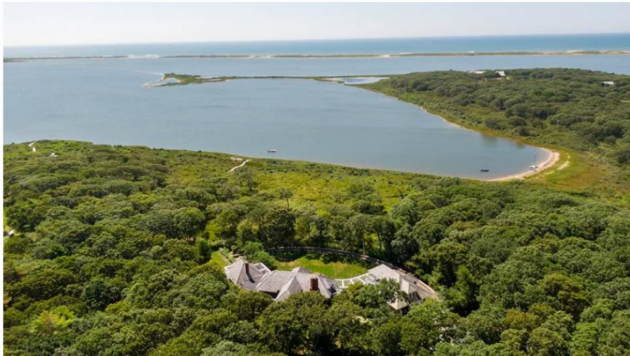
Martha's Vineyard, Massachusetts remains a popular retreat for U.S. presidents, tycoons and stars.

Massachusetts' Martha's Vineyard has long been a magnet for high profile home sales given its status as an elite haven for presidents, business magnates and celebrities.