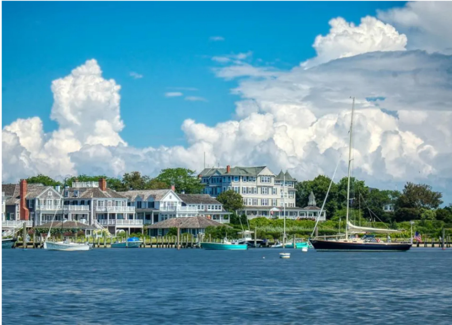
From across Edgartown Channel on Martha's Vineyard, Massachusetts the town of Edgartown is a short ... [+]

renovated in 2019; it includes a two-bedroom guesthouse built in 1999. The view takes your breath away: a very intimate view of Menemsha pond, but from high up. It's a salt-water pond that eventually leads to the Vineyard Sound. The 4,150 square-foot home is on three acres with 750-plus feet of pond frontage that includes a 48-foot dock. Fourteen of the 16 rooms in the home and guesthouse have those amazing pond views. We've listed the home for $9.95 million .