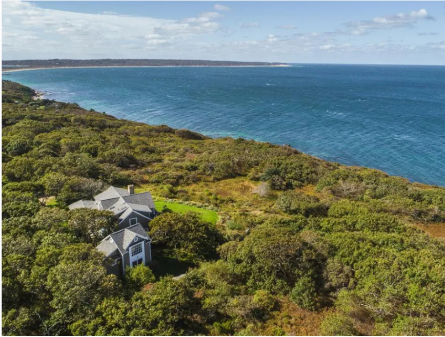
A custom $9.25 million home takes in spectacular water views along the north shore in Chilmark. TEA LANE ASSOCIATES

good for swimming, versus the south shore that's along the Atlantic Ocean.