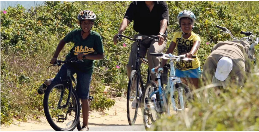
Former President Barack Obama, center, and family ride their bicycles along the Lobsterville beach... [+]

Representing an intriguing mix of residences spread across the island’s six towns , Tea Lane Associates is steeped in the island’s storied history—its pioneering women founders opened the real estate firm in 1967.