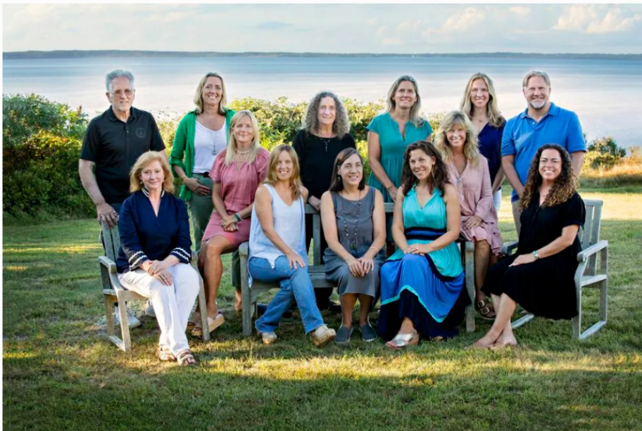
In 2023, Tea Lane's 13-member firm represented buyers in the Vineyard's top two priced land... [+]

Definitely, and especially in the way they took risks. When they arrived, they purchased a large tract of land off Tea Lane in Chilmark and turned it into a subdivision, creating a really wonderful neighborhood of homes. But they were outsiders. Being among the few women in the field at the time, they were challenged. They definitely got pushback, but they never backed down. They were very generous people with big hearts, and people grew to love them. I strive to be as generous as they were.