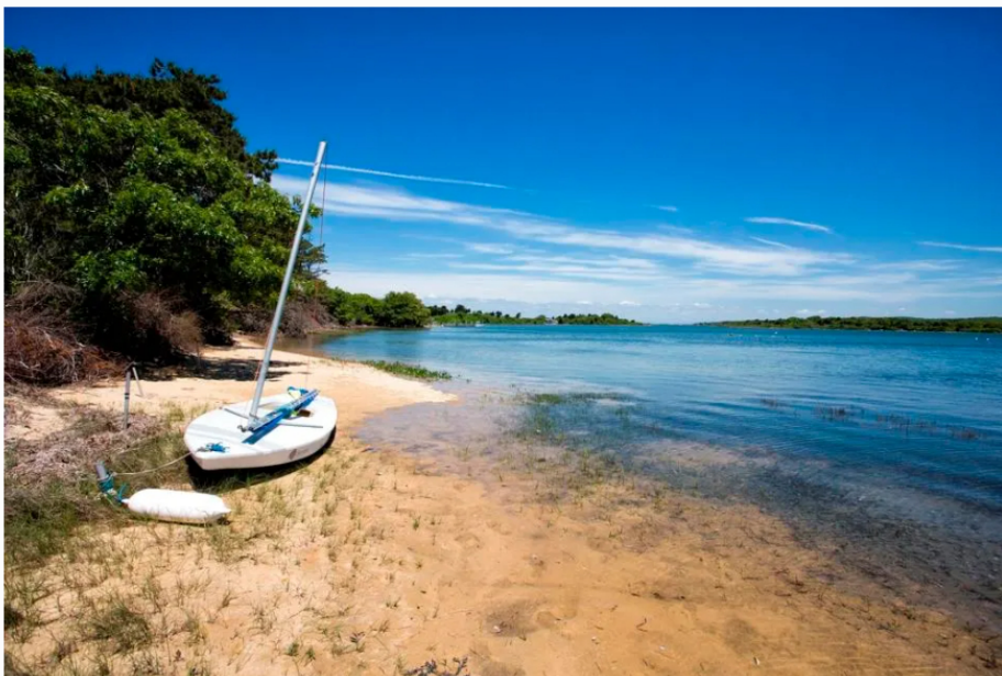
A sailboat sits in the sand on a private beach in Chilmark.

The majority are from the U.S., but we get buyers from all around the world. In the U.S., most are from the east coast, and there's also a very big California contingent. And there are other areas, including Chicago and Texas. People used to view the Vineyard as a place to spend a few weeks. I think more are now wanting to spend longer periods of time here. Many buyers are looking for a second home that they'll cherish and stay in for a good part of the year. They become members of our community and they contribute to it in many different ways.