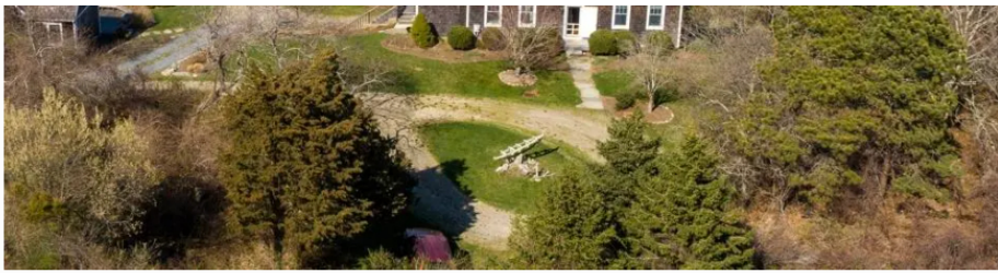
A family compound listed at about $10 million sits on three acres of Chilmark waterfront with ... [+] TEA LANE ASSOCIATES